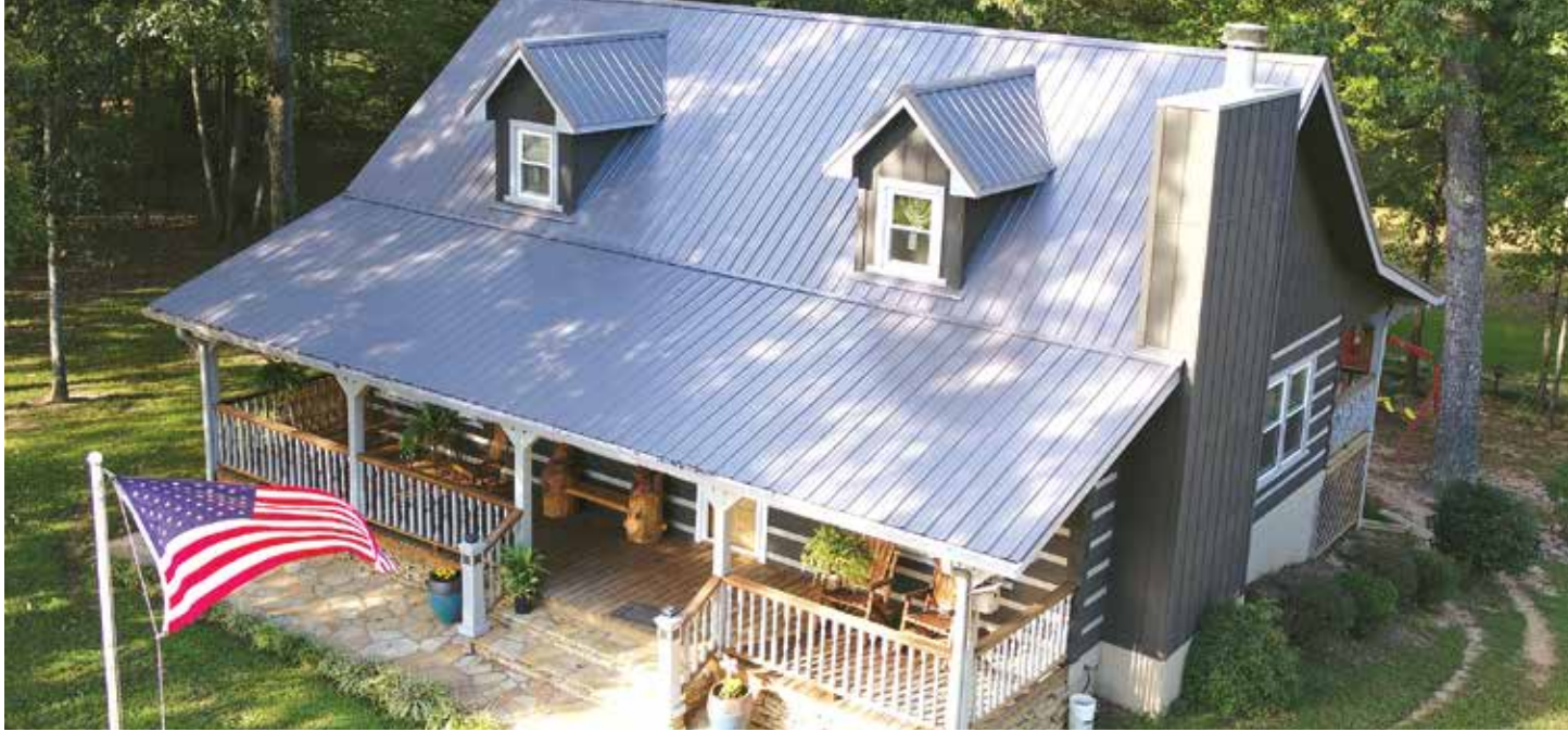
Panel-Loc Plus™, Charcoal