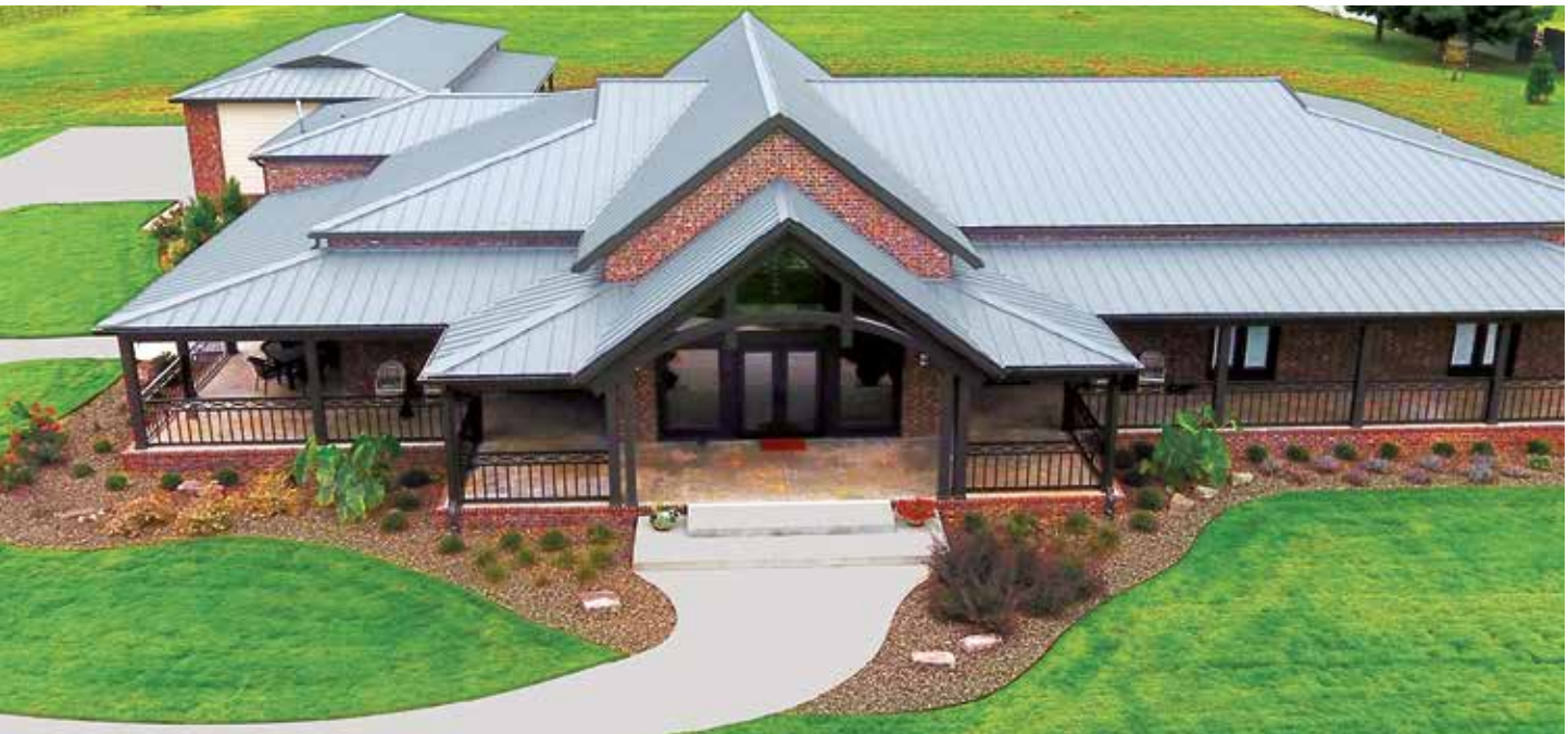
Central Snap®, Galvalume®