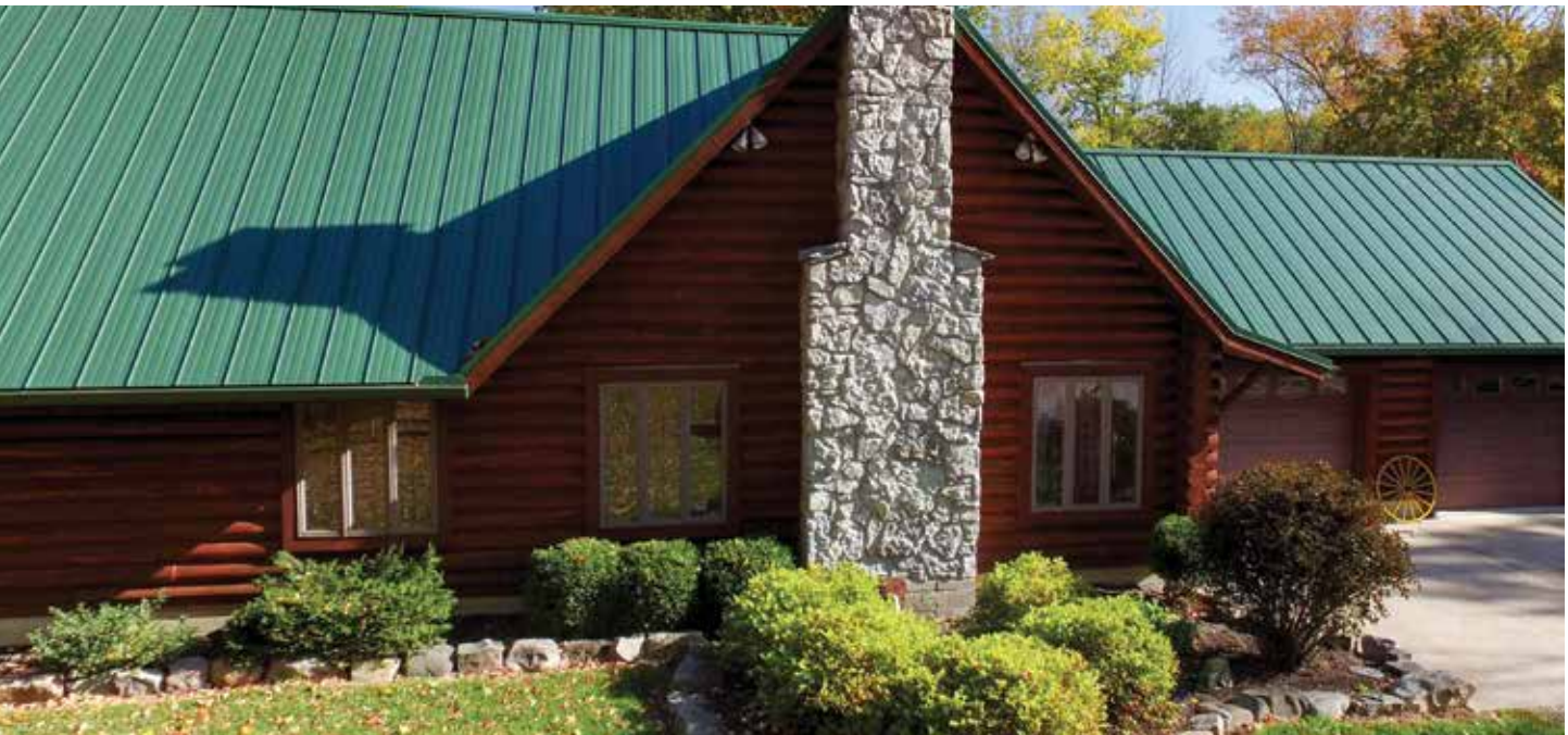
Horizon-Loc™, Basil texture